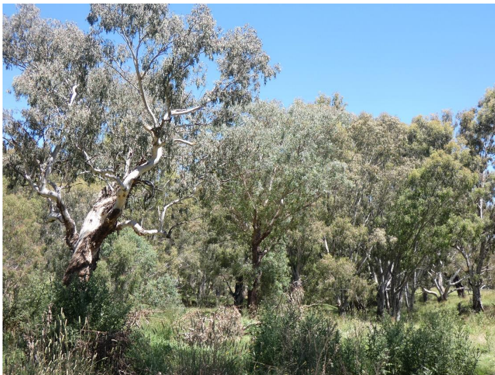
Wyangala Dam, near Reid's Flat, Eucalyptus melliodora woodland to be inundated

In January Rosemary Stapleton, Denis Marsh and myself visited the areas that would be permanently flooded if the wall is raised, including Ecologically Endangered Communities (box woodland) and some wonderful red river gum gallery forest, not to mention large areas of highly productive farmland. Our guides were local farmers David and Sue Webster.